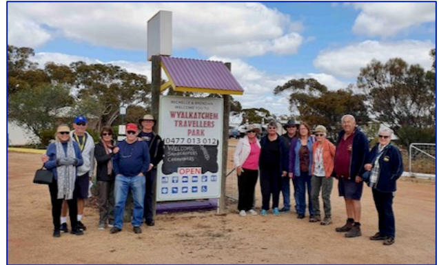
Sandgroper pose by the 'Welcome' sign in Wylie.