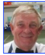
Chris Back Com. Member